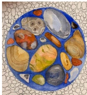
Pebbles and Stones Ink & Watercolor