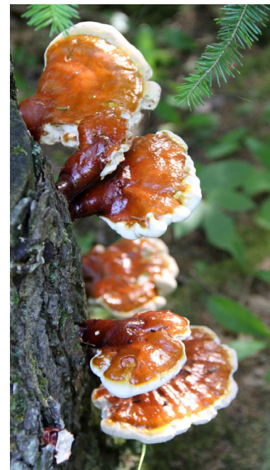
Finding Fungi at Higgins Lake (photography) was accepted for publication in Walloon Writers Review Ninth Edition.